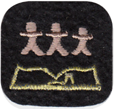
Me and My Family