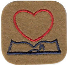
God Made Me