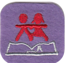
In God's Family