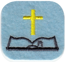
Jesus Our Savior