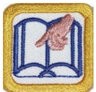
Bible Explorer #4315