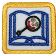
Being Me #4324