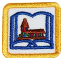
My Church #4326