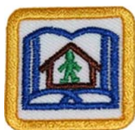
My Family #4320