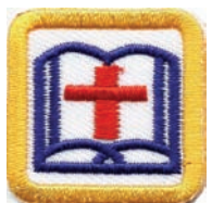
Meeting Jesus #4331